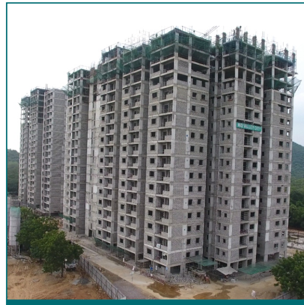
South East View