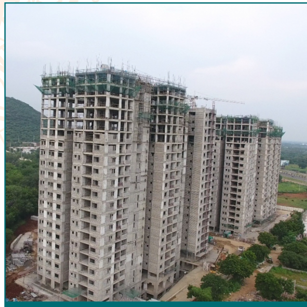
South West View

Construction work is going on full swing at 'The Residences at Mid Valley City'. All the three towers are up and rising fast, as you can see from the images below. Other works such as Electrical, Plumbing and Fire Services are also progressing as planned.