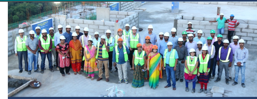
Mid Valley City Team

Concrete topping up of Tower Everest (Unit No.s 3, 4 & 5) 19 th floor was completed on 31 st Aug'17 by our valued purchasers from that block.